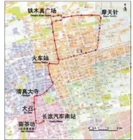
Hohhot Boulevard Master Plan