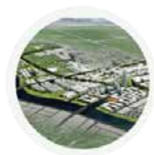
○ FPT City Danang