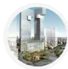
○ Bitexco The One Tower Project