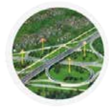
○ Long Dau Giay - Phan Thiet Expressway