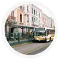
○ Hanoi Bus Rapid Transit