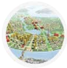
○ Thu Thiem New Urban Centre