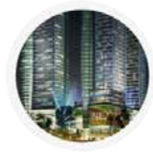
○ VietCapital Project