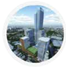
○ Saigon Central Masterplanning and Traffic Engineering Review