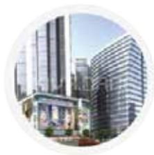
○ Savico Tower