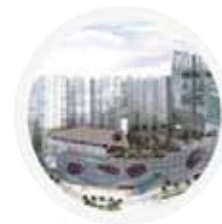
○ Vina Square