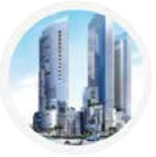
○ Traffic Consultancy for Berjaya Financial Centre