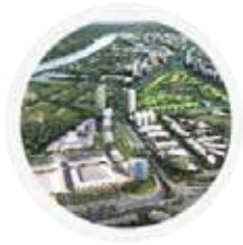
○ Vam Co Dong New Urban Area, Long an province