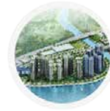
○ South Rach Chiec New Development Project