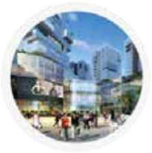
○ Bitexco Ma Lang Centre